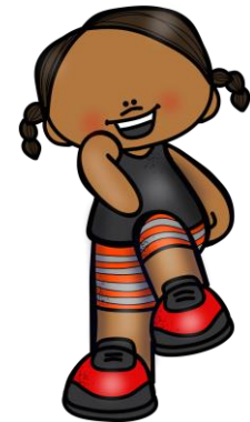
elbow to knee