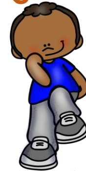
elbow to knee