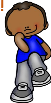
elbow to knee