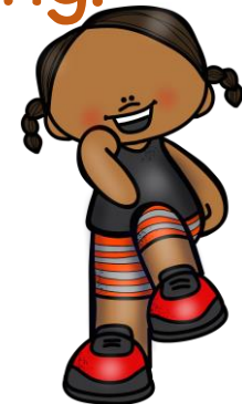
elbow to knee